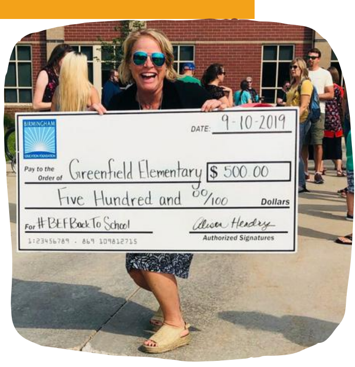
$500 awarded to Greenfield for winning the shoe-fie contest