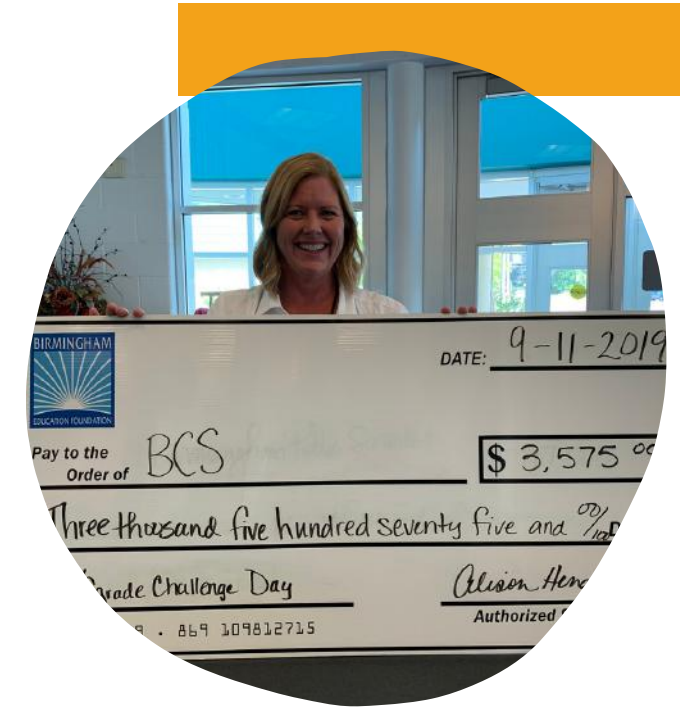
$3,575 awarded to BCS for Challenge Day, thanks to an application submitted by Cindy Balicki